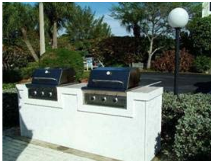
New Gas Grills—Poolside

LITTLE GULL COTTAGES : The staff is very proud of Peggy Boone for receiving the Shining Star Award for Longboat Key!